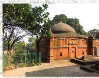
Burial tombs of Qutub Uddin and Sher Afghan