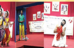
18th Global Competition at Bangkok, Thailand