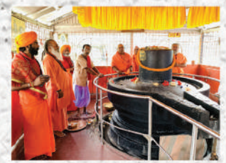
Baba Bardhamaneswar Mandir