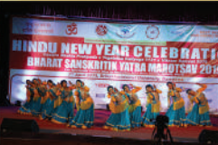
19th Global Competition at Malaysia.