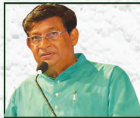
Dr. Soumen Mahapatra Honorable Minister, Govt. of West Bengal