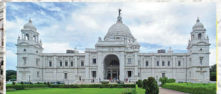
Victoria Memorial Hall