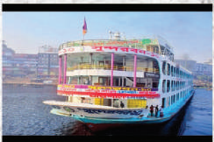
Sundarban House Boat