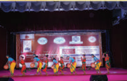
18th Global Festival at Bangkok, Thailand.