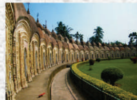
108 Shiv Mandir