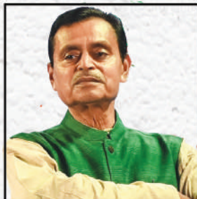
Mr. Swapan Debnath Honorable Minister, Govt. of West Bengal