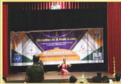
20th Global Competition at Singapore